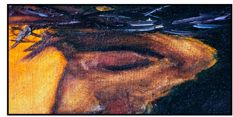
A special thanks to our Altar Guild and readers for working diligently to make our Good Friday Service special.

Please depart in silence after dismissal Dismissal